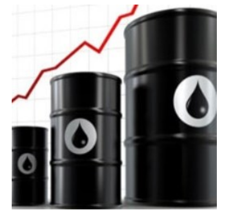
Within the frameworks of implementation of the Nation's Plan "100 concrete steps to implement five institutional reforms" in terms of introducing the international system of reporting standards on crude hydrocarbon reserves the Committee of Geology and Min-

eral Resources of the Ministry of Innovations and Development of the Republic of Kazakhstan formed the corresponding Target working group. On October 29 the first meeting was held during which the results of the work done were reviewed, and the Roadmap of activities for implementing the international system was KAZENERGY Association discussed. announced that first of all it is necessary to carry out analytical work to study the international experience of both countries taking leading positions in matters of subsoil use, particularly in attraction of investments to exploration, and our partners in the EAEC.